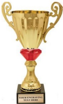
Demo Team Trophies

Grand Champions –ALL COMPETITORS who earn at least ELEVEN (11) points will earn the grand champions ring.