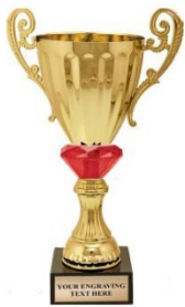
Demo Team Trophies

We have special 3D Printed End pieces that can be used to assemble 9 medals into one ‘ultra-medal’ pyramid.