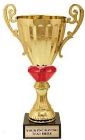
Demo Team Trophies

We have special 3D Printed End pieces that can be used to assemble 9 medals into one ‘ultra-medal’ pyramid.