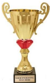
Demo Team Trophies

Grand Champions – ALL COMPETITORS who earn at least ELEVEN (11) points will receive a 24K Gold Plated Championship Ring. Note that we cannot guarantee sizes.